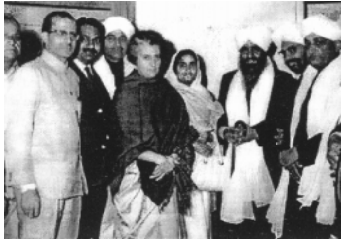
Nirankari Chief Gurbachan with his patron Indira Gandhi who helped establish the divisory sect to malign the Panth.