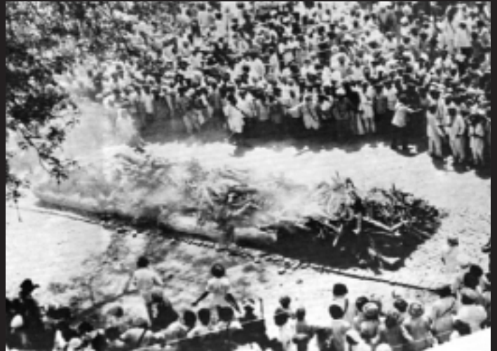
The funeral pyre of the thirteen Shaheeds