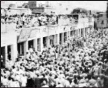
The funeral procession led by the Panj Pyare and flag bearers progressing through Amritsar