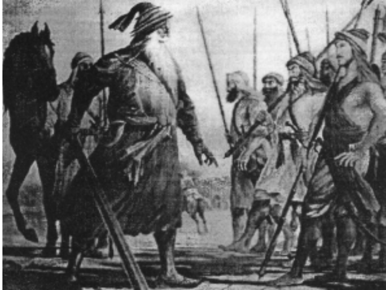
Gursikhs with Baba Deep Singh Ji

Bhai Fauja Singh felt that the Sikhs living in cities were not prepared to sacrifice their lives for their Guru; several previous incidents had proved this. So he now turned his attention to the villages so that perhaps the sleeping Panth, which lay dormant within rural life, could be awakened from its slumber.