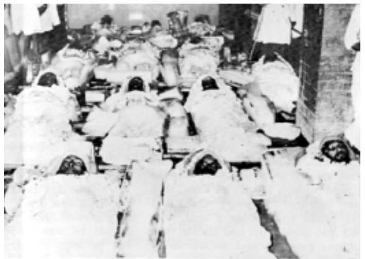
The bodies of the Shaheeds awaiting cremation

Frustration grew amongst the Sikh masses against the government and the Hindu media barons, such as Lala Jagat Narain, who deliberately and consistently depicted Sikhs as 'terrorists'. Baba Jarnail Singh's popularity became a threat to the government that had by then began to plan Operation Bluestar to bring the Sikh Panth to heel by attacking their temporal and spiritual sovereignty.